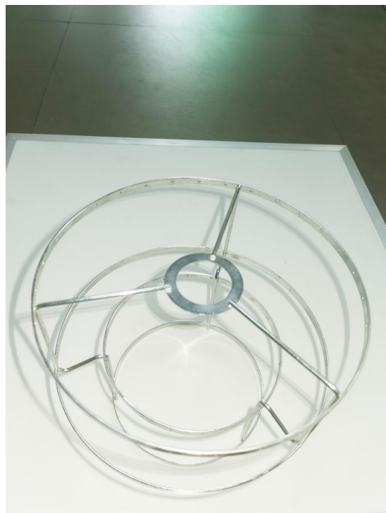
Production workshop display

Multi function looping machine, widely used, can be used as long as it is a flat iron circle or a flat iron circular arc Convenient setting, automatic counting, punching cylinder can be one cylinder or two cylinders according to needs