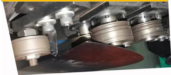
Technical parameters of servo circle machine

送线轮 光洁，耐磨，多线槽，精加工 wire feeding wheel is smooth, wear-resistant, multi trunking and finish machining